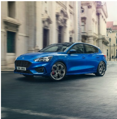
The wait is over. Introducing our best car ever – the most innovative, dynamic and exciting car we, at Ford, have ever built, the All-New Ford Focus

All the passes for entry and cars you may need will be issued in the June meeting at the same time payment will be requested .